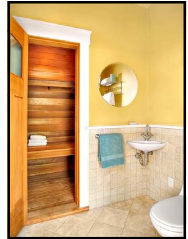
3233 Hunter Boulevard South $995,000

A n extraordinary remodel/rebirth of one of Mount Baker's most historic homes. Featured in the Seattle Times upon its completion in 2000, this 1914 modified Foursquare was lovingly restored with the finest vintage and re-created materials. Among its many features: